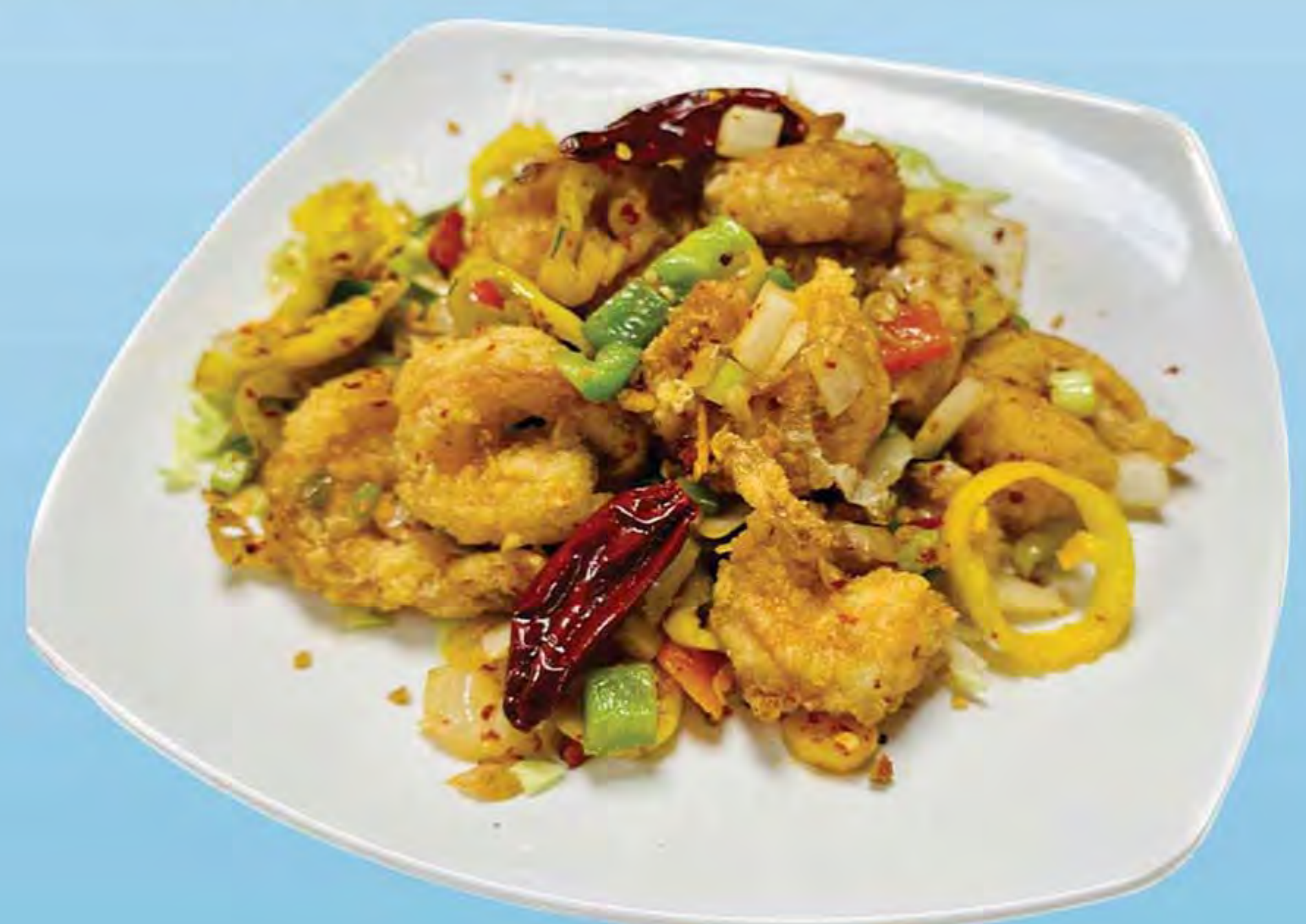
Crispy Spicy Pepper Shrimp