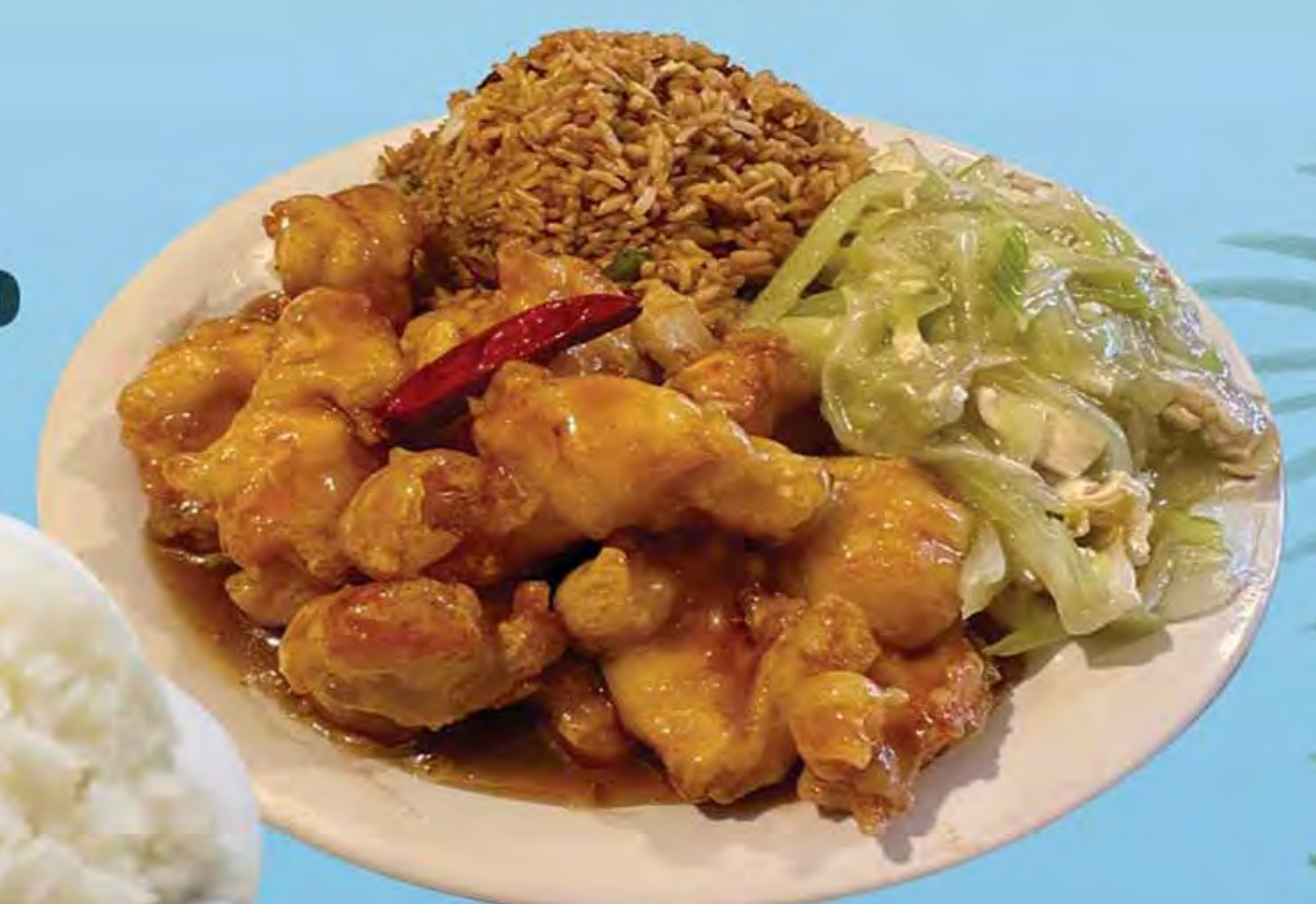
General Chicken w. Chow Mein Combo