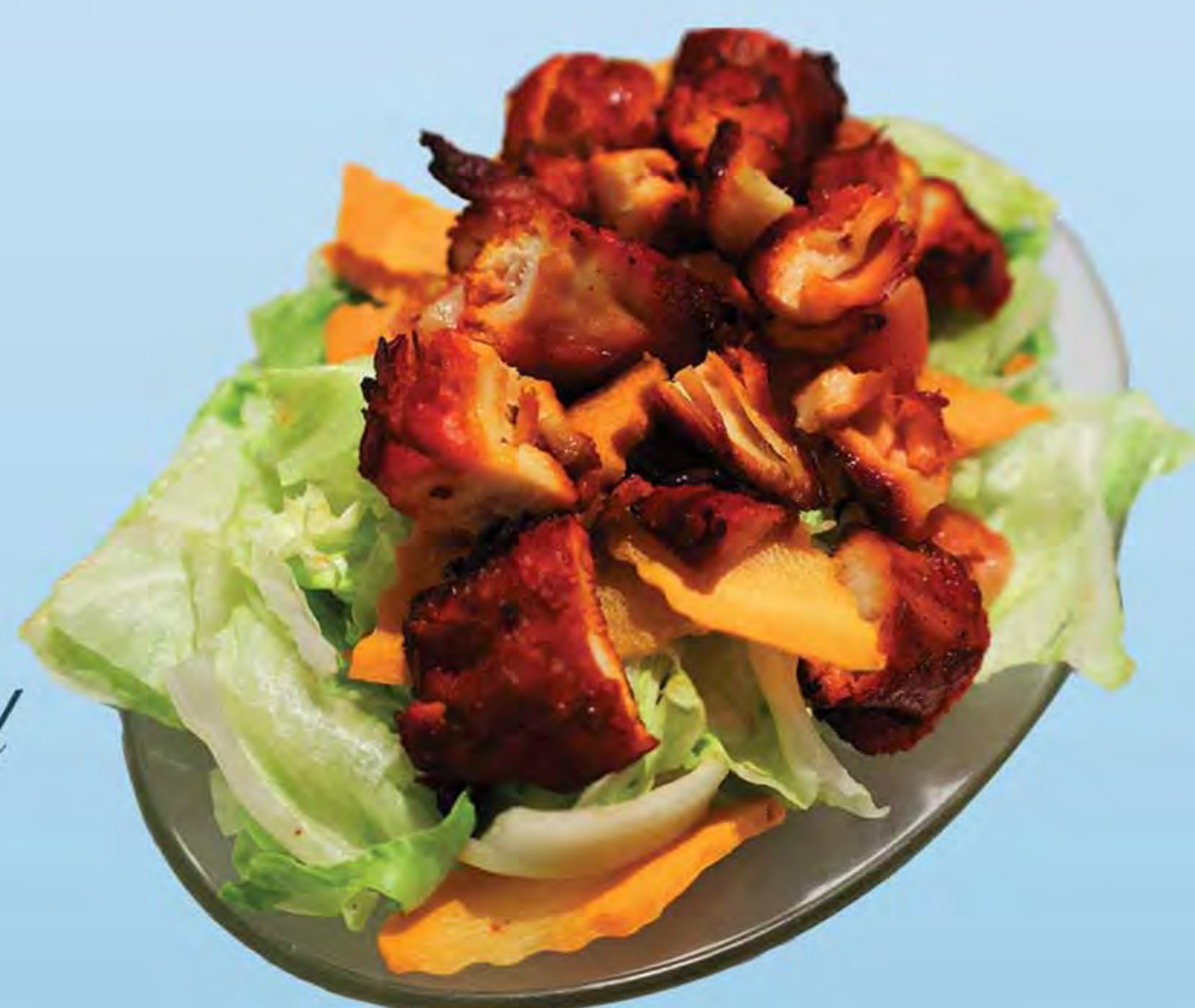
Chicken Teriyaki Salad