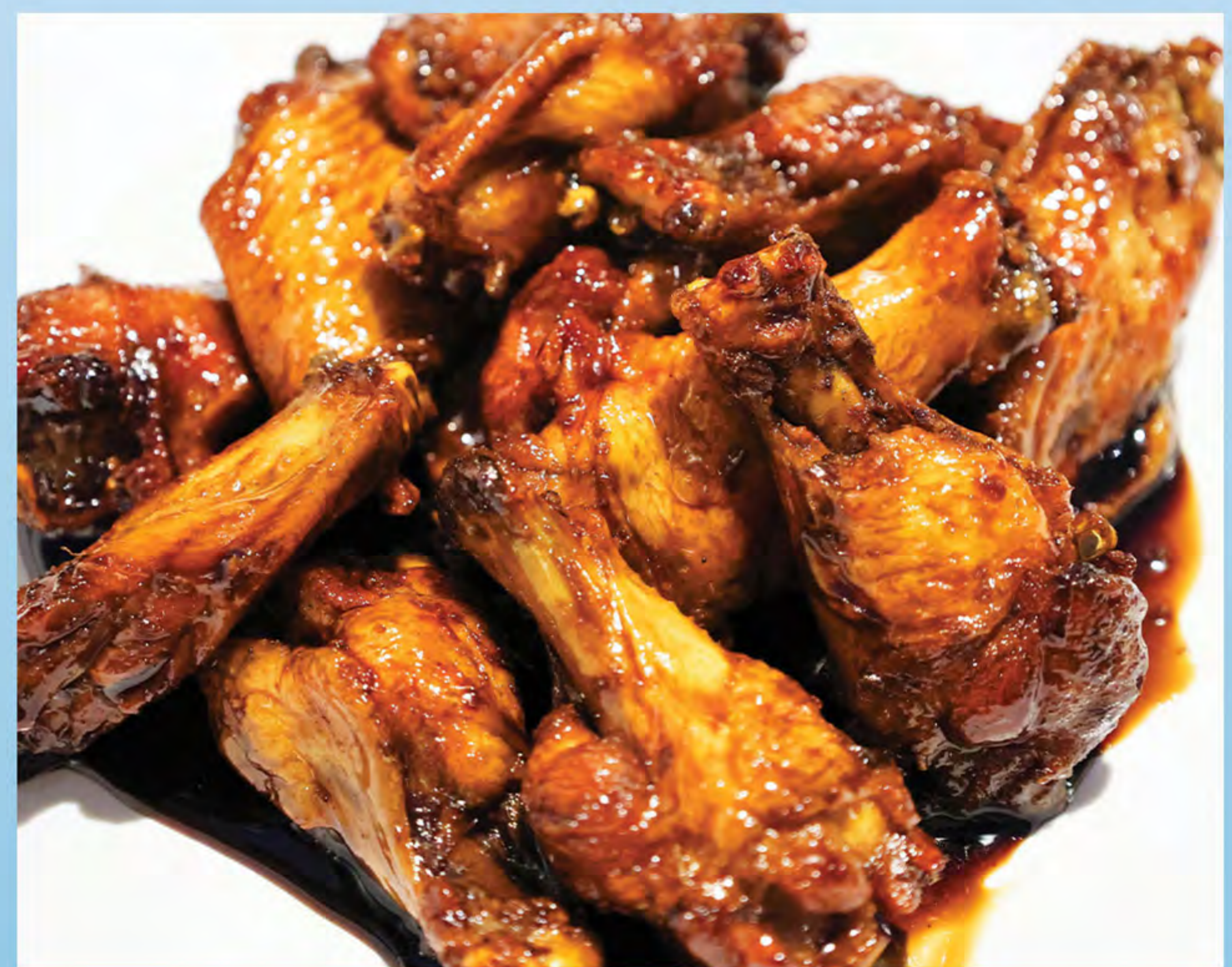
Islander Wings in Sauce