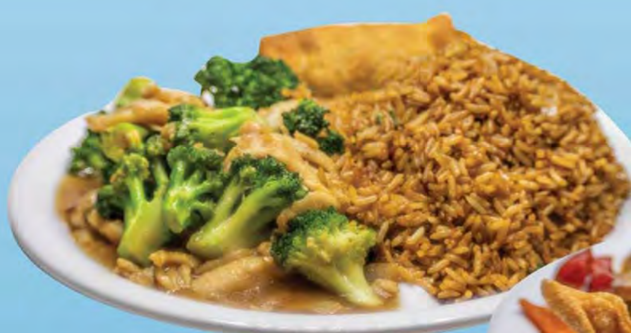
Chicken Broccoli Combo

15. Chicken Finger / Beef Teriyaki with Crab Rangoon and Pork Fried Rice 13.00