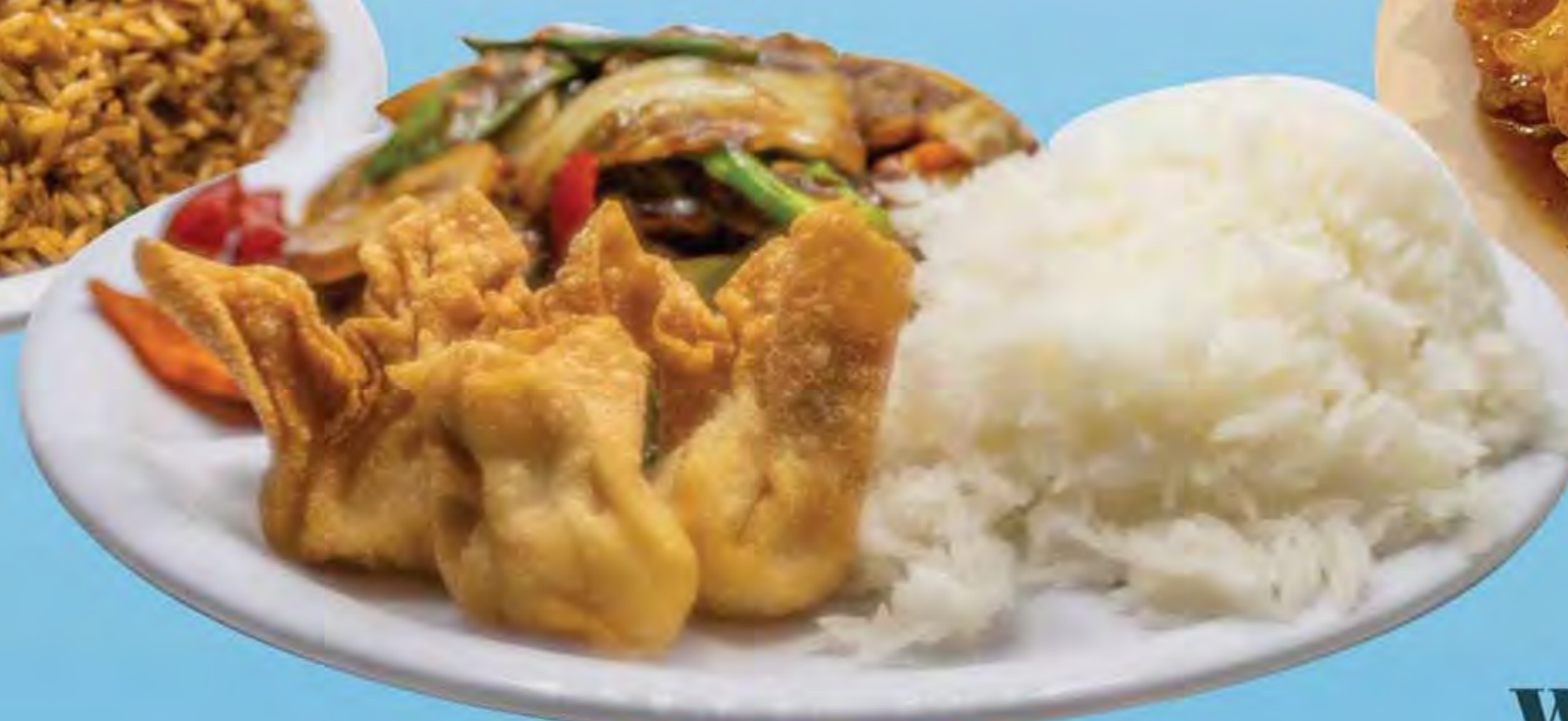
Peking Beef Combo