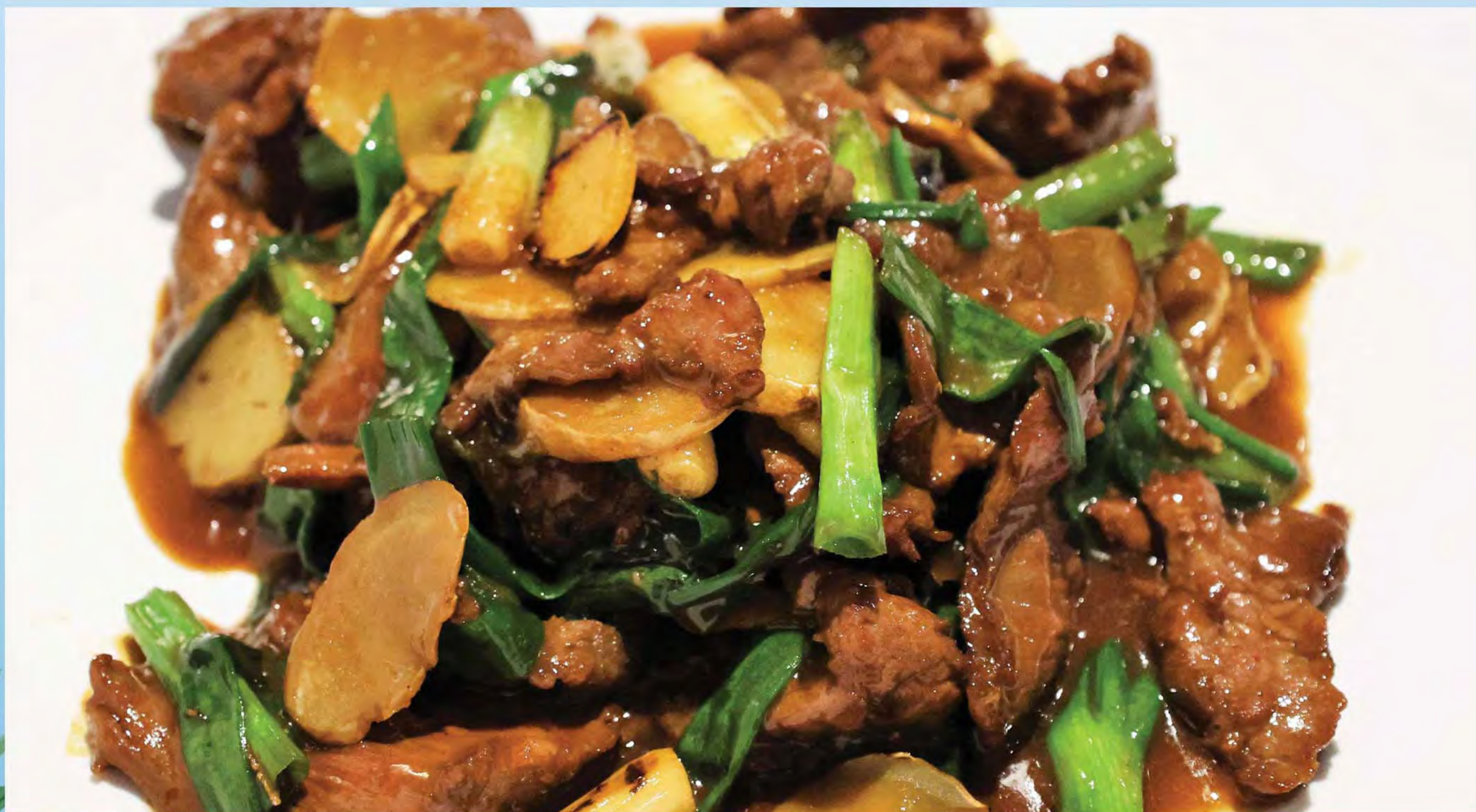
Scallion Ginger Beef